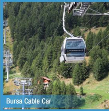
Bursa Cable Car